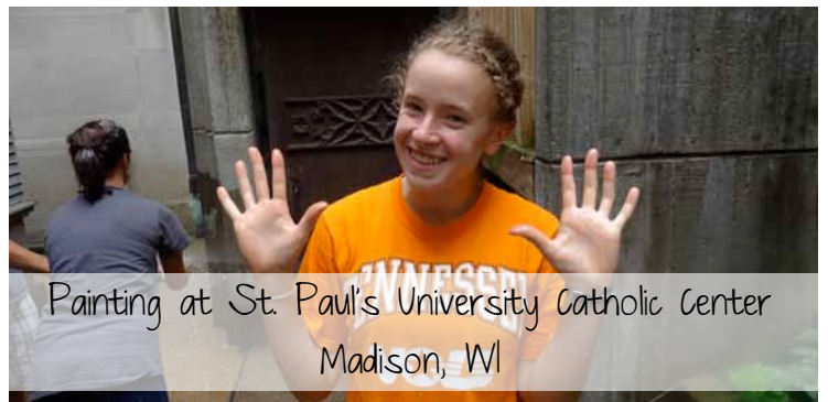
Painting at St. Paul's University Catholic Center Madison, WI