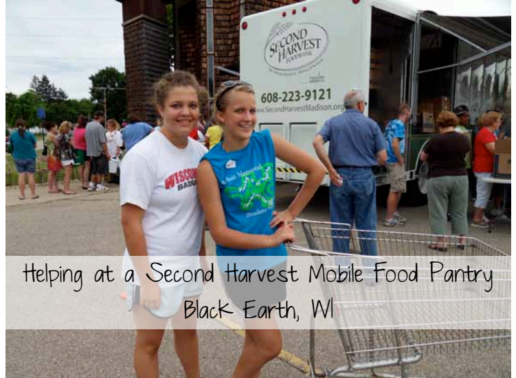
Helping at a Second Harvest Mobile Food Pantry Black Earth, WI