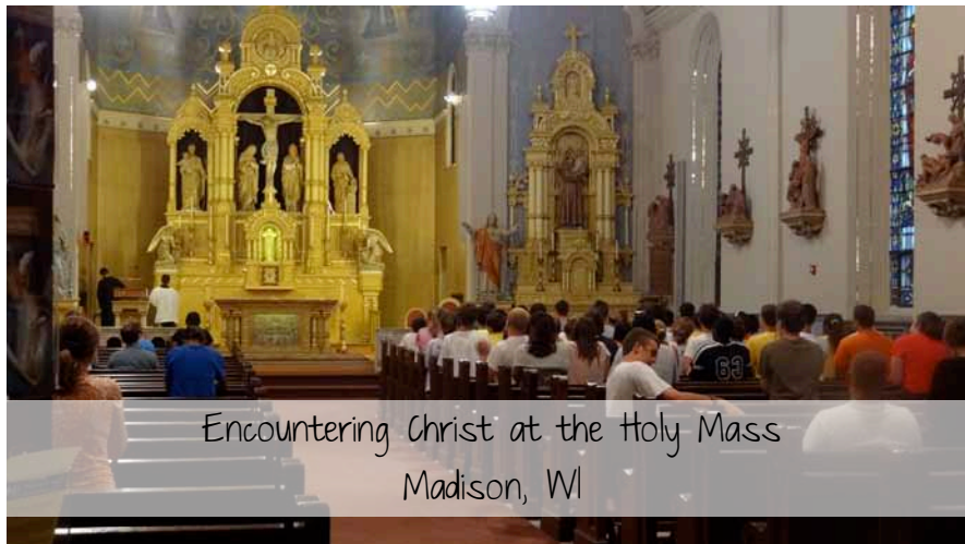
Encountering Christ at the Holy Mass Madison, WI